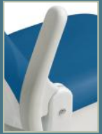
BISCAYNE SWIVEL ARMRESTS