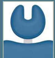
PONY TAIL HEADREST