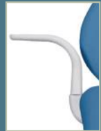
BISCAYNE FIXED BASE ARMRESTS WITH ONE OUTWARD ROTATING ARM