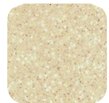
Dry Creek Riverstone 9136RS

*Minimum order of 4 cabinets with Elite Series