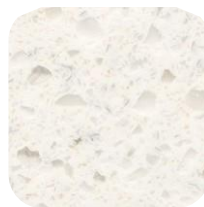
Avalanche Melange 9175ML