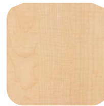
Fusion Maple 7909