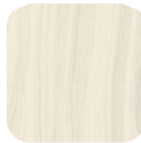
White Cypress 7976