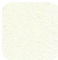
Milk Glass Spectra 9077ST