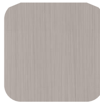
Astro Strandz 4940