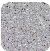
Northern Melange 9195ML