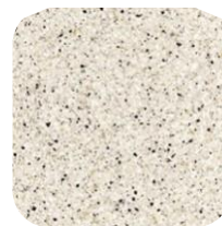
Arctic Melange 9070ML