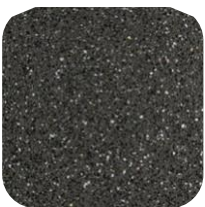
Midnight Melange 9091ML