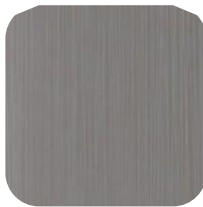
Cosmic Strandz 4941