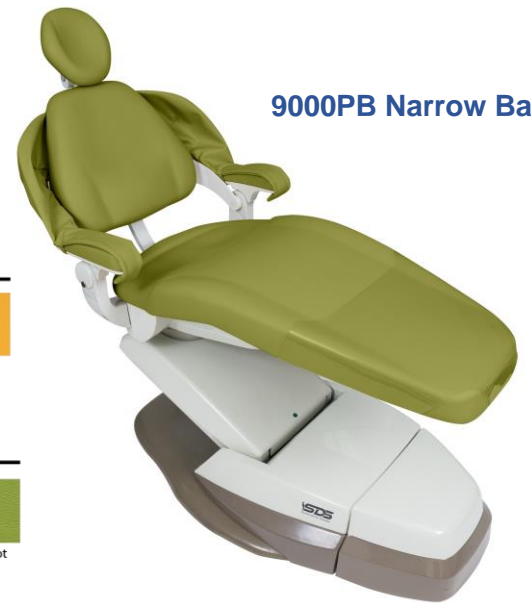
9000PB Narrow Back